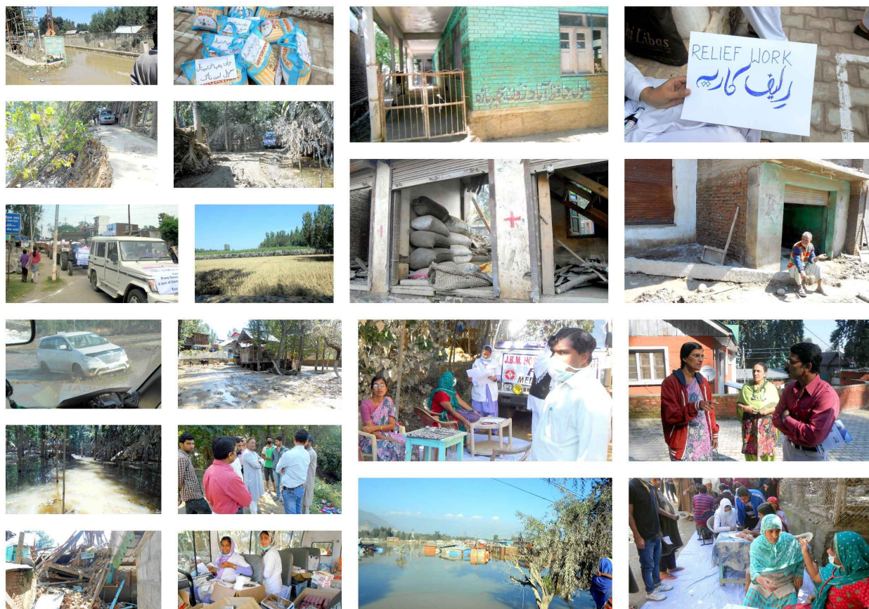
EHA's response to Jammu & Kashmir Floods 2014